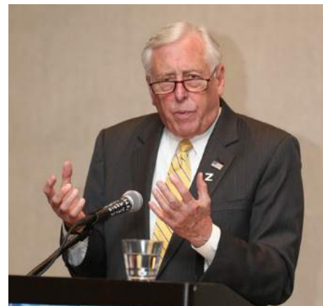
Hon. Steny Hoyer addressed the forum during the first day. He is member of the Center's Advisory Board.

At the forum, Maryland Congressman Steny Hoyer noted that widening inequality in wealth, income, and opportunity poses a serious threat to the long-term success of our nation. In 2013, he had joined some of his colleagues to create the Democratic Whip Task Force on Poverty, Income Inequality, and Opportunity.