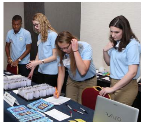
Student Ambassadors at the reception desk.

Forum attracted 250 registered attendees.