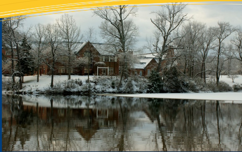
After the Storm (pictured above)