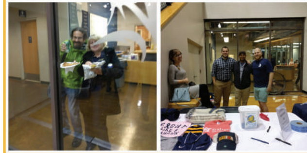
Staff enjoying the SMCM basketball games on February 3rd for the Staff & Faculty Appreciation Night