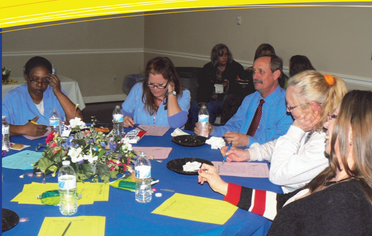
Staff enjoying pizza, word games, and laughs at the Spring Fling on Mar 19.