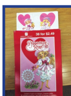
Binders, desk organizers, and vintage Valentines? Oh my!