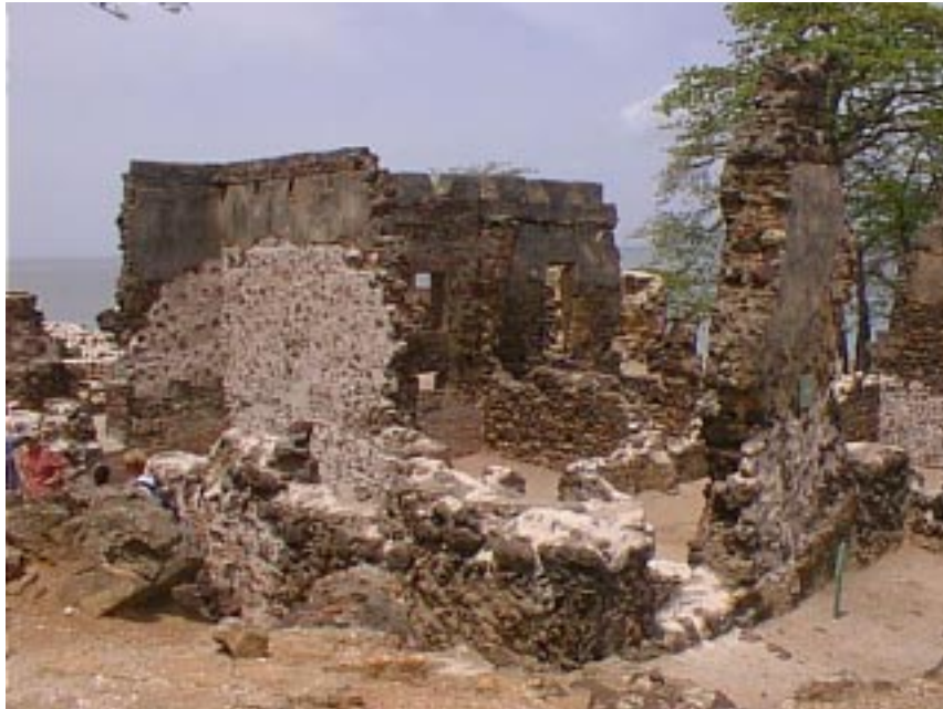
Another view of famous slave factory/fortress on James Island