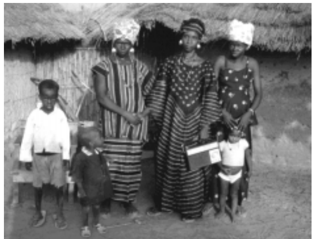
Co-wives with children

None liked the idea of sharing their husbands with another woman. They all spoke of the tension that at times is present with their co-wives because of feelings of jealousy. Despite the negative impression of polygyny that they presented, they were positive individuals and hopeful for their children's future. All believed that polygyny is an antiquated practice, and that it is becoming obsolete. They all believe that as the younger generation is educated, they will be less likely to practice polygyny. This is especially true for young women, who they believe are beginning to assert their rights, both within the Islamic faith and in all aspects of social life, including marriage. In fact, there are now many women's organizations that address many problems in Gambian society that affect women. They also mentioned that economic