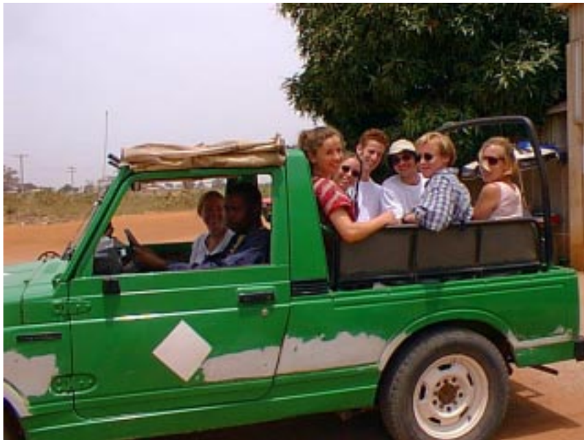
All set for a trip down the coast