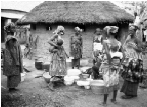
Women with children near kitchen area in Bajakunda village

In these interviews I wanted to obtain the Gambian perspective and attitude on polygyny. I formally