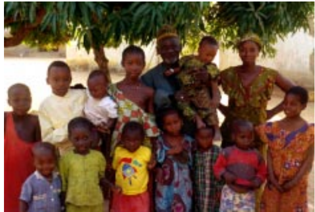
Camara household from Bajakunda village, patriarch with one of his wives and many of his children

Marriage legitimizes sexual relations between men and women. In the case of polygynous marriages men can licitly and legitimately have sexual relations with more than one woman. A man 'rotates' his attention equally among all his wives unless they are