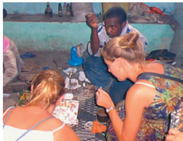
Students in a silversmith’s shop in Basse, Upper River Division.

But The Gambia can be a challenging place to live and work, particularly for young U.S. college students who have never been to Africa. Once the initial honeymoon phase captured by the phrase “Oh wow, Africa!” wears off, young college students confront adjustment to the occasionally oppressive heat, the drone of ever present, malaria-carrying mosquitoes, and the realization that “we’re not in Kansas anymore.” Culture shock has a hard edge. Lively colorful marketplaces where you might enjoy a bit of bargaining with vendors are also congested mazes of stalls where the strong smells of dried and fresh fish, overripe fruit, and stale urine engulf you. Add to this the pressure created by hustlers, potential pickpockets or aggressive merchants who reach out for you as you walk by. It takes time to realize that even poor U.S. college students are wealthy by Gambian standards.