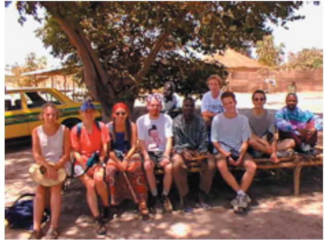
The 1998 group on the bantaba at Tanje village museum.

The remainder of this volume is based upon the work of nine students who came with me to The Gambia in the