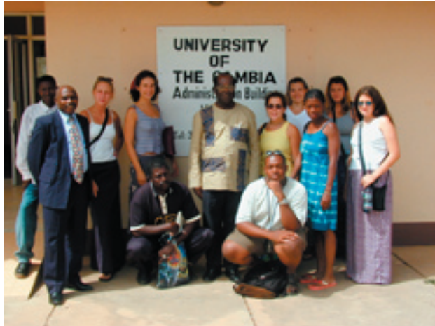
SMCM students with administrators from the University of The Gambia. Let’s look out for one another, SMCM & UTG.

students participated in the field program. If the ‘third time is the charm’ as we often hear in the United States, meaning that it is usually ‘right’ on the third occasion, then it was the participation of these three students and their perceptions and perspectives that enriched the trip and made it ‘right[eous].’ I consider it a special privilege to have been a guide for these students and witness them reconnect spiritually, intellectually and emotionally with their ancestral homeland. They engaged their African experiences with a vigor and enthusiasm that affected us all, and to some degree, served as a positive model for other students.