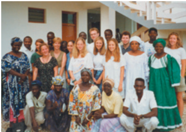
The first group of St. Mary's students to live and study in The Gambia for a six-week period in 1996.

Since 1996, St. Mary's College of Maryland has sponsored three field study programs to The Gambia, West Africa. Ten students joined me for the first program in the summer of 1996. They stayed in Gambia for a period of either four or six weeks. Each student selected a research topic and, with help from me and the Gambians or expatriates I knew, collected original data for a report on their topic. We published the reports together in a volume titled Tubabs Under the Baobab: Study and Adventure in West Africa . We sent our friends and colleagues in The Gambia copies of the volume, and gave another 20 copies to the Methodist Bookstore where they were sold for 100 dalasis apiece. They sold quickly, but not long thereafter, the bookstore closed.