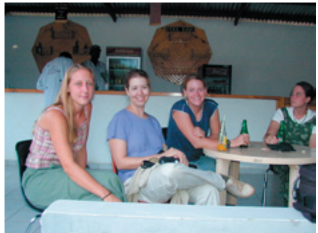
Peace Corps volunteers and staff made a tremendous contribution to our learning experiences in The Gambia.

The Gambian government has made increasing access to quality education a national priority. I extend my thanks