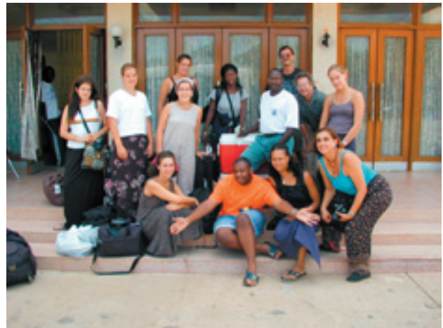
Picture of St. Mary's College participants after one week in the 'provinces' or interior of the country in 2000.

Perhaps the most significant aspect of the 2000 field program for me was that for the first time African American