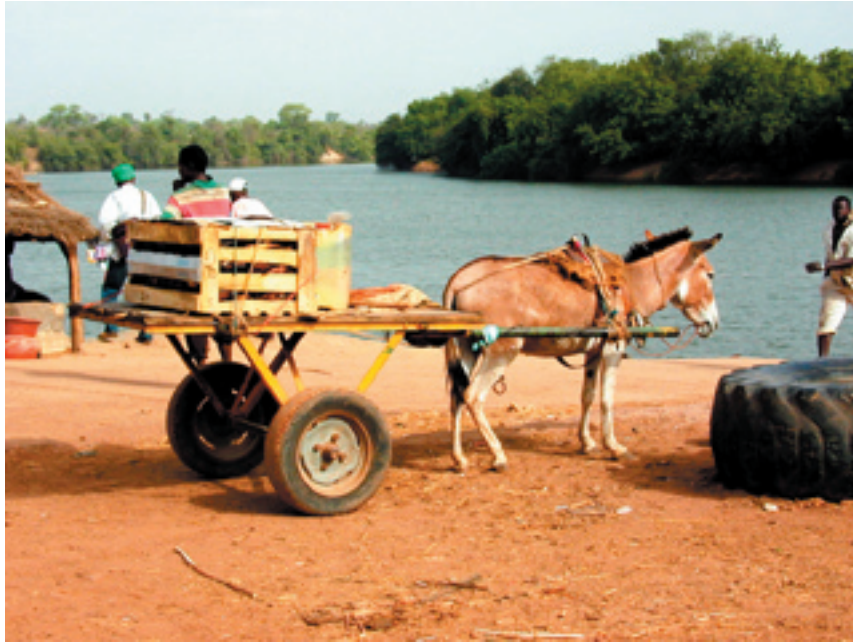
Donkey carts carry all kinds of goods and people in The Gambia, particularly in the 'provinces.' This cart is waiting for the ferry to cross from Basse to Wuli district, Upper River Division.