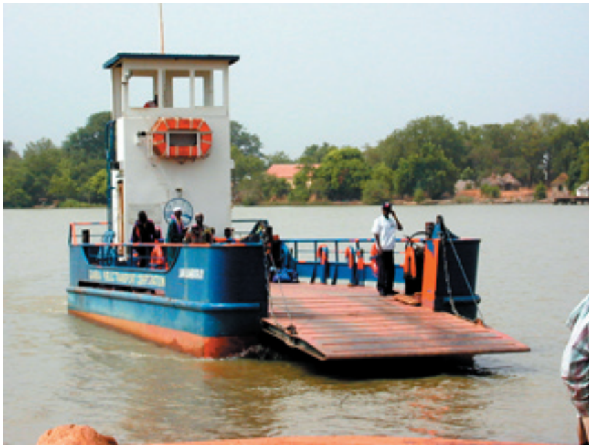
There aren't any bridges yet across the river Gambia, so people still take ferries, such as this one at Janjangbure, Central River Division.