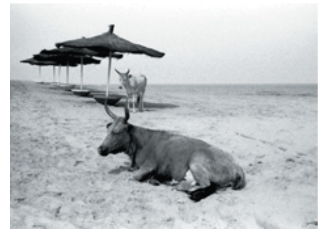
The beaches along West Africa's coast attract not only masses of European visitors during the winter months, but cattle during the off-season.

otherwise be bumsters can become knowledgeable foresters, artists, fishing guides, and the list goes on. They would be given the chance to work with tourists while continuing to bring money back into communities. At the same time, they would interact with tourists who want to learn about their culture instead of tourists who would take them back to the hotel room. The entire mindset changes. Ecotourism is a profitable way to show local communities the value of what is at their feet. If people see that tourists are interested in their culture and ecology, they will place a higher value on it. This appreciation manifests itself in environmental and cultural preservation – the people are given financial and personal motives to protect and cherish their local resources. Sustainability is a built-in attribute of ecotourism.