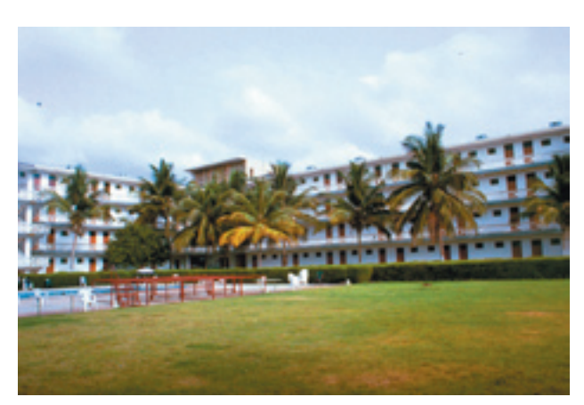
Hotels in the coastal areas, such as the Friendship, help confine the benefits of tourism to the Greater Banjul Area.

The many problems with tourism are often overlooked because of its incredible potential as an economic and social benefit. There are at least two major benefits offered by the tourism industry. First of all, tourism can serve as a way to redistribute wealth. Tourism is becoming a known source of poverty alleviation, when it is sustainable and established in a way that channels money into the government and communities. This is a difficult undertaking for countries such as The Gambia, where foreign countries have already laid a foundation that is neither sustainable nor economically beneficial to them. Local entrepreneurs and government organizations face stiff competition among these foreign establishments. However, there is great promise and good will in the implementation of tourism as a poverty alleviation strategy. The need for cash flow in developing nations cannot be satiated by tourist dollars, but it can be quenched to some extent. The business is one of leisure money, which could be put to use in communities where it is most needed. Imagine knowing that the money paid for a week in a hotel will be used to help build a hospital or a school.