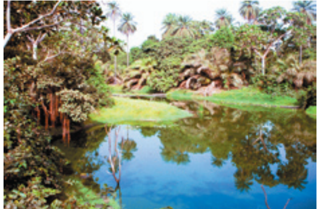
Abuko Nature Reserve is a beautiful example of successful nature tourism in The Gambia.

The objectives of the tourist are only part of ecotourism, as it also requires a very high level of responsibility and awareness. The UK's Department for International Development has outlined a "triple bottom line" challenge to tourists and tour operators, declaring that economic, environmental, and social factors must be attended to simultaneously (DFID 3). The very nature of ecotourism is dependent on