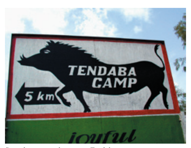
Sign that points the way to Tendeba tourist camp, one of the earliest upriver camps in The Gambia. Hunting bushpig used to be a draw, but now people come for birdwatching and other eco-activities.

of efforts to bring tourism to the upriver provinces. Tendaba works closely with the neighboring village, sometimes sending visitors to stay in the village for about two nights a week. Birdwatchers are common among the tourists that stay at Tendaba Camp, but outside the tourist season (October-April) Tendaba is an area used for conferences. The camp used to have a variety of caged animals, but in 1990 received orders from Banjul to release them. However, the camp did not lose its focus on local wildlife. The boat rides, bush taxis, and various activities available at Tendaba demonstrate a continuous focus on ecology. Although Tendaba Camp is not strictly an ecotourism site, it could easily provide the experience that an ecotourist seeks. By successfully bringing tourist business upcountry, Tendaba has provided many opportunities that benefit the local people.