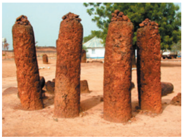
Cultural heritage sites, such as the stone circle megaliths at Wassu, are among Gambia's many tourist attractions.

local resources. If The Gambia is to benefit in full from the influx of tourists, it must establish its own tourist sites, encouraging government or community owned and operated establishments. Ecotourist sites are ideal for this type of entrepreneurship because local people would logically be the best hosts. Unfortunately, this is not always the case with ecotourism. The sites are frequently run by foreigners. However, a foreign operator at an ecotourist site is bound to take more care in directing money flow into the host country than would a conventional tour operator.