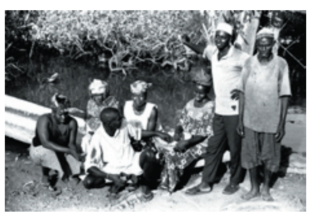
Members of the Tumani Tenda management group.

They offer batik lessons, fishing, drum lessons,