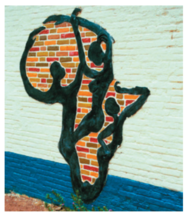
Africa's cultural and natural assets hold an enormous appeal to tourists from around the world.

Ecotourism is generally understood as "environmentally and socially responsible travel to natural areas that promotes conservation, has