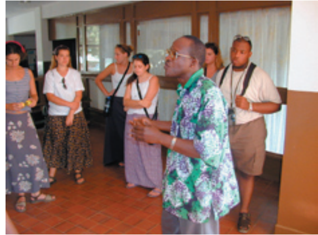
Gambian teacher from the Management Development Institute speaks with SMCM students.

Even though these figures are lower than the national average of non-Gambian teachers (36% non-Gambians at the Junior level, 77% at the Senior level (Huguet & Pénel 2000: 16)), they still illustrate the heavy presence of foreign teachers in the Gambian school system.