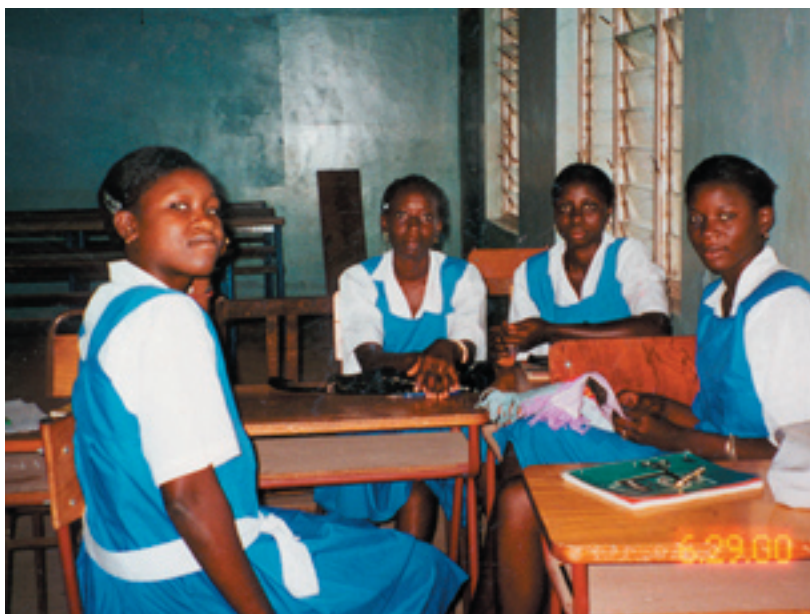
Gambian students usually speak several languages, and learning French provides them with another cultural and possible employment skill.