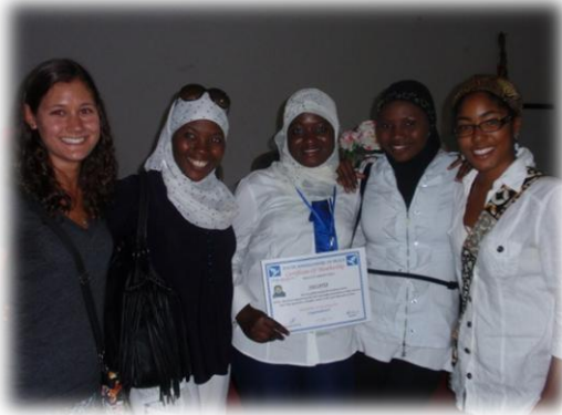
Youth Ambassadors of Peace Program

year, SMCM students, faculty, staff, and community members travel to The Gambia through this program. SMCM's PEACE program in The Gambia is uniquely positioned to enhance academic excellence at both the University of The Gambia (UTG) and St. Mary's College of Maryland.