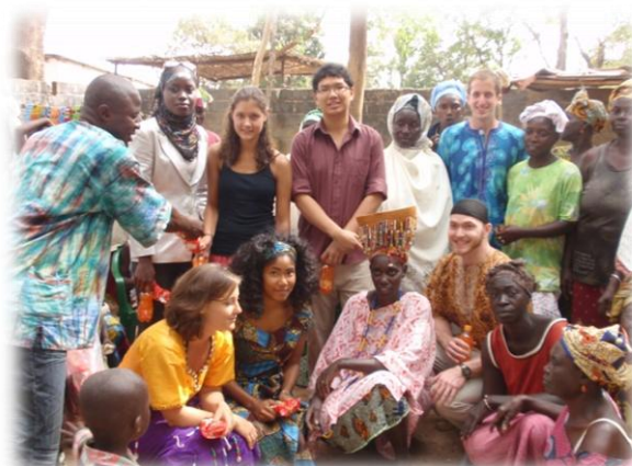
Traditional naming ceremony held for SMCM students

This summer issue of The PEACE Advocate provides information to the SMCM community about the PEACE program's activities over the spring semester, 2011. This is the first issue illustrated with photographs that I hope will be "worth a thousand words."