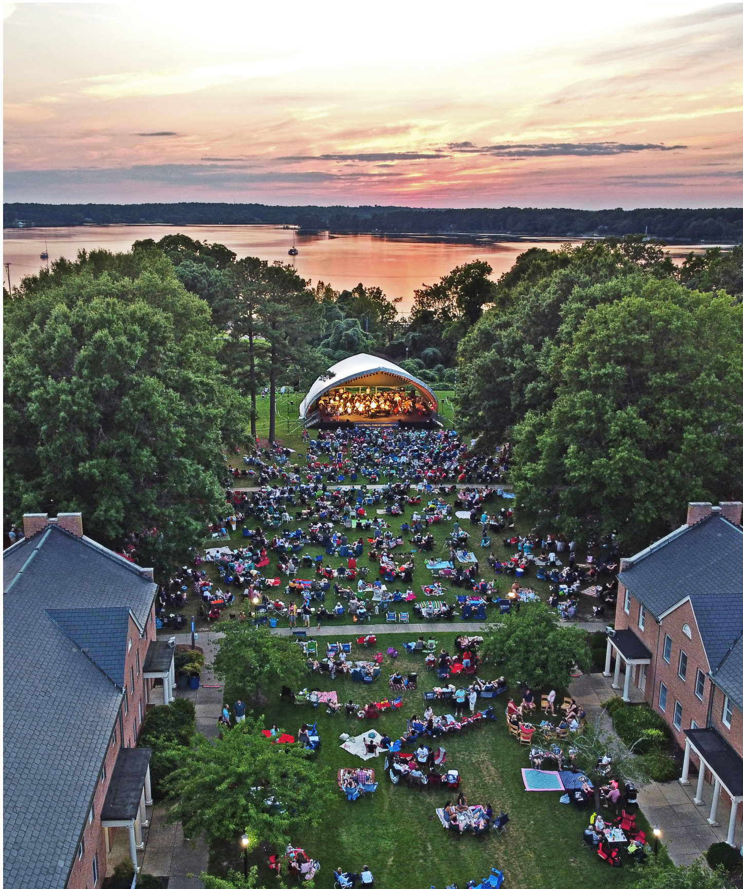
The local community has embraced the summer River Concert Series.