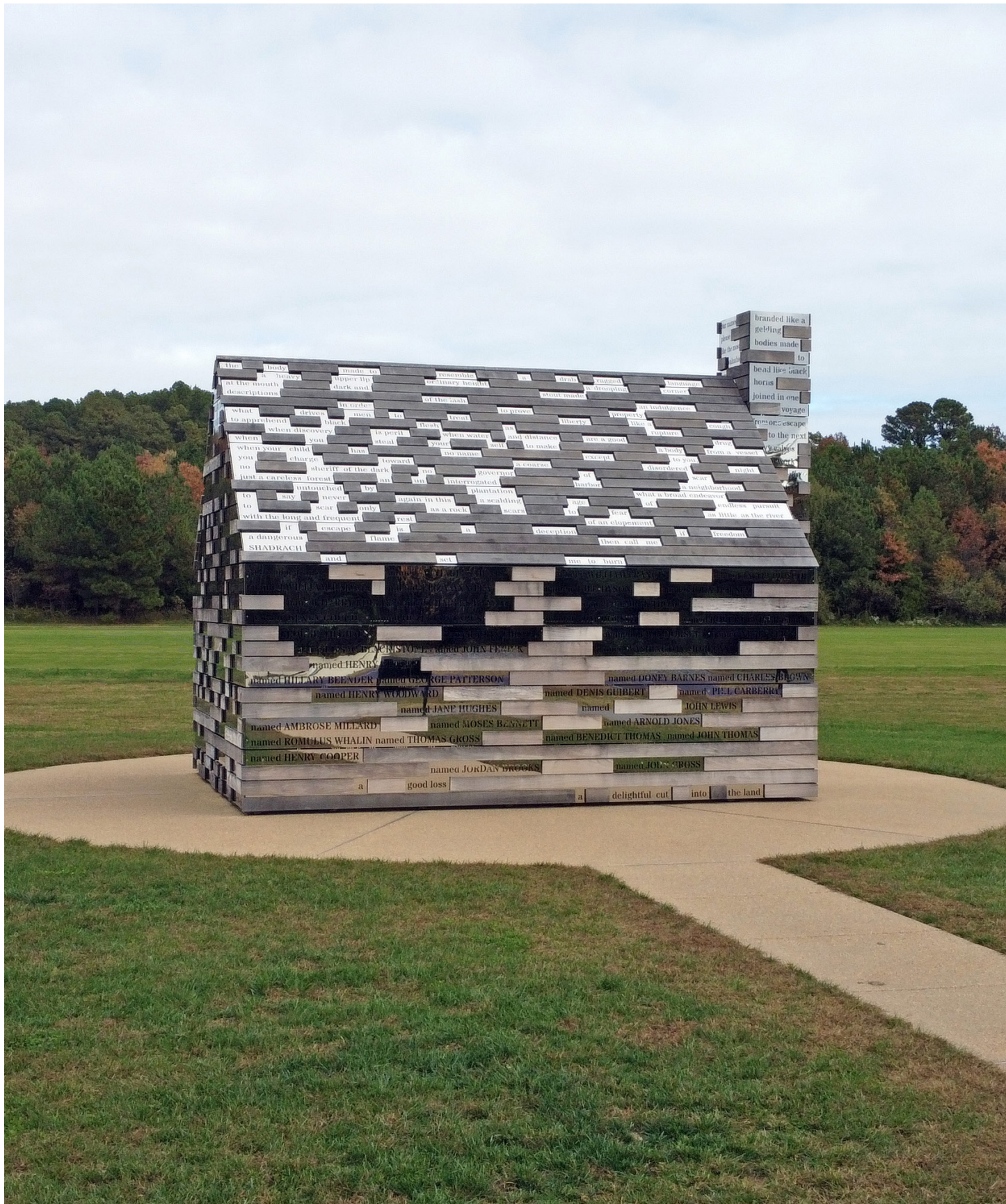
The award-winning Commemorative to Enslaved Peoples of Southern Maryland sheds light on our shared history.