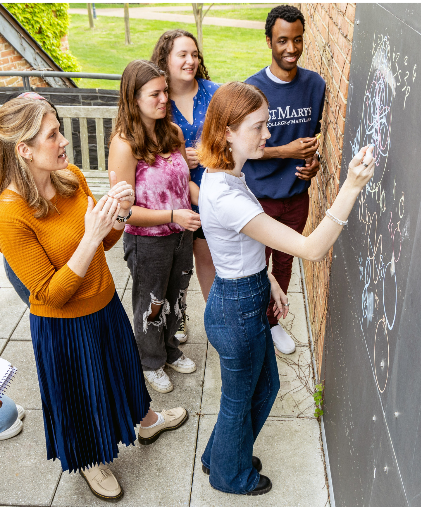
Small class sizes and a commitment to teaching allow for close student-faculty interaction.