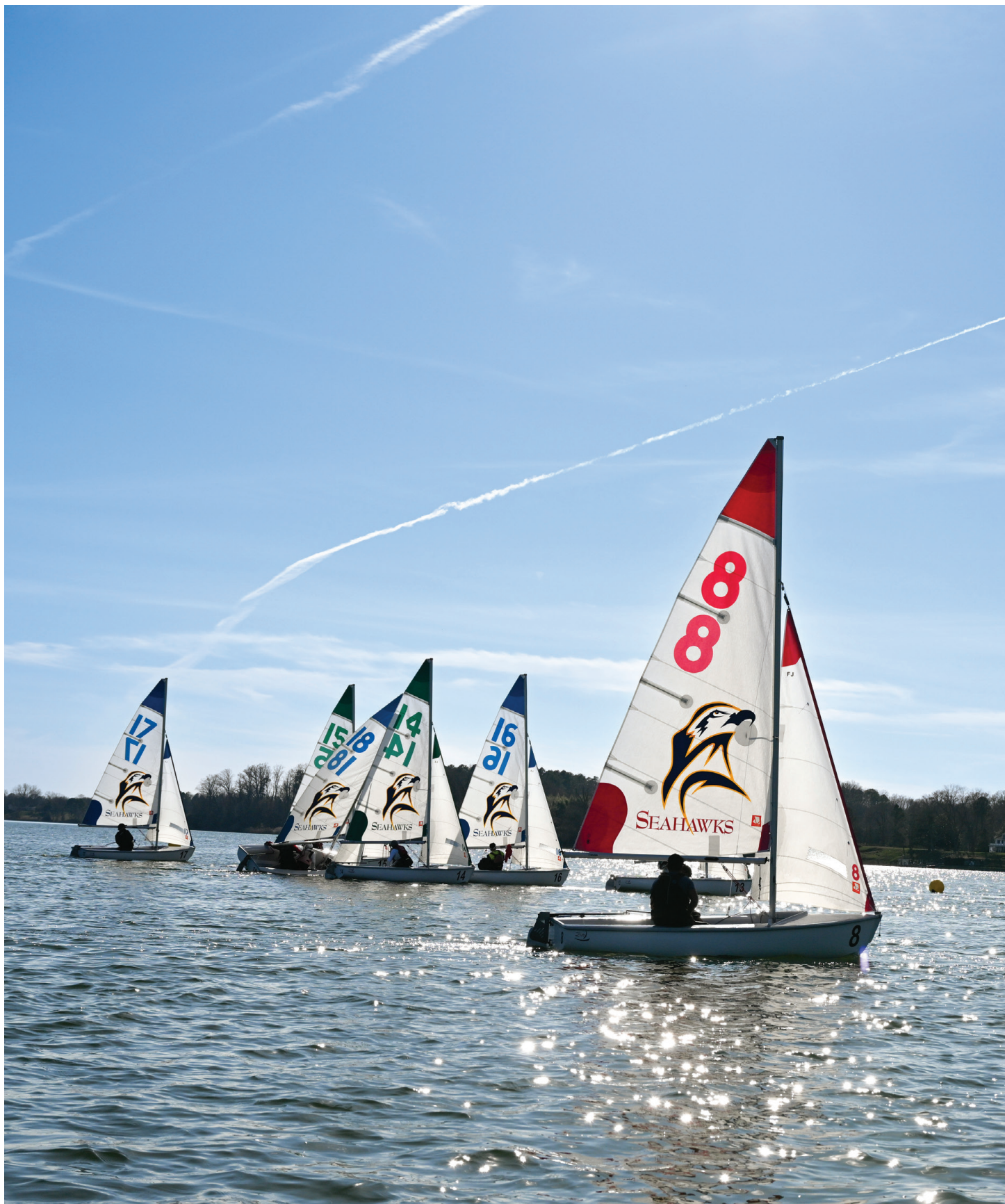
The St. Mary's River adjacent to campus provides endless academic, athletic and recreational opportunities – life is better by the river.