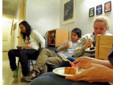
Our new Exchange students enjoyed a home-cooked meal of grilled chicken fettuccine and cheese cake.

After recovering from their long flights, they were launched right into action! The students met with College administrators from a variety of areas, and went over such essentials as roommates, housing, and basic guidelines for the College. The IE Office also assisted them in getting their ID Cards and computer access. We also tried to incorporate a few ice breakers such as mummy-wrapping and a wonderful home-cooked meal