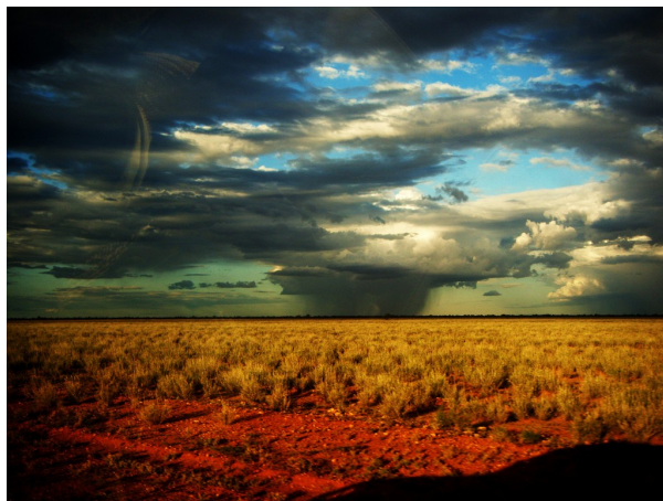
Winner of the 2011 Student Photo Contest