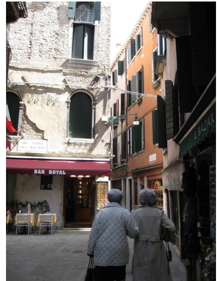
6th Place in the 2011 Student Photo Contest